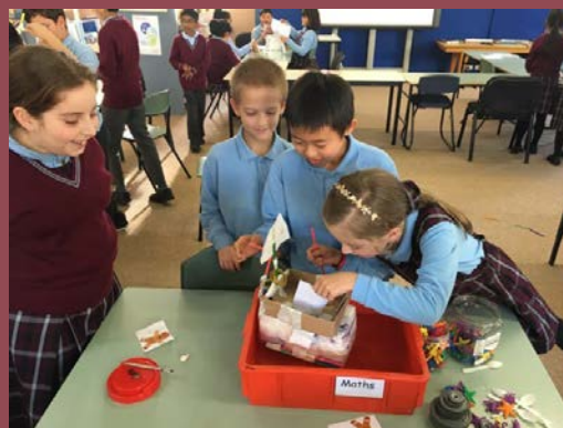
In teams, students made a structure from straws and marshmallows that had to meet specific criteria.