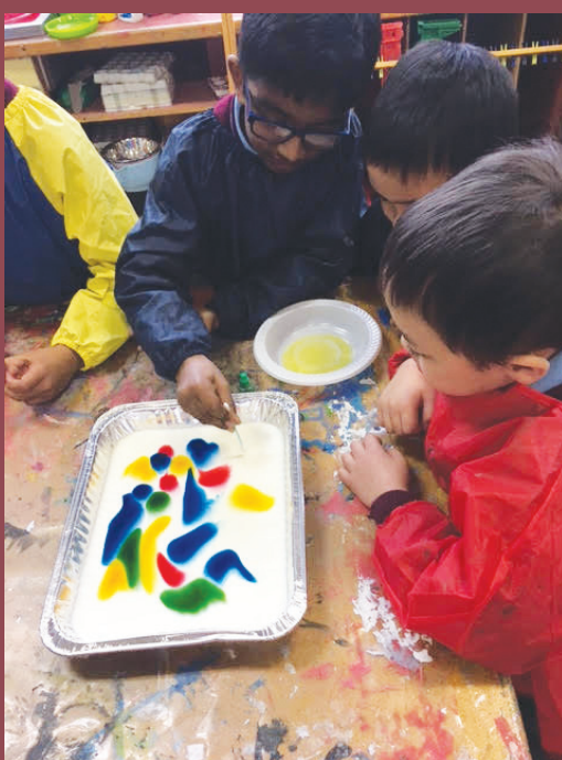
In teams, students made a structure from straws and marshmallows that had to meet specific criteria.