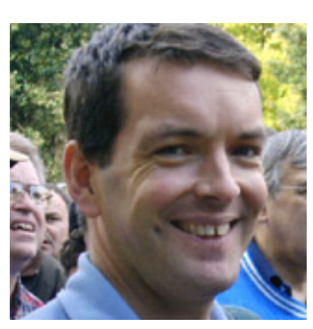
continued over page . . .