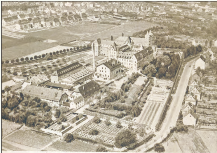
Missionshaus der Pallottiner in Limburg a. d. Lahn