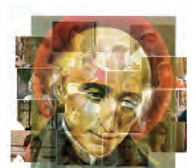
St. Vincent Pallotti canonized 1963